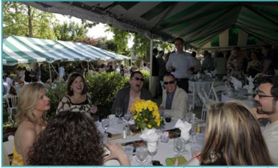
Young Friends enjoying dinner under the tent before the performance of A Little Night Music .