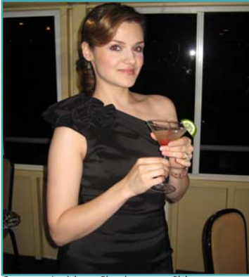
Soprano Andriana Chuchman at Chicago Opera Theater's First Annual Boat Cruise in September 2009.