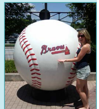
Father's Day with The Atlanta Opera Comprimarios and the Atlanta Braves.

For more information and updated event listing, please call 404-881-8883, or follow us online: www.atlantaopera.org www.facebook.com/TheAtlantaOpera www.twitter.com/TheAtlantaOpera