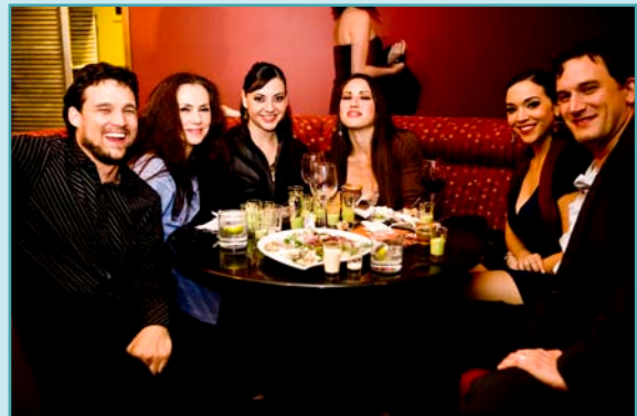
Guests enjoy the ARIA After-Party at the revolving Bona Vista Lounge atop The Westin Bonaventure in Downtown L.A.

To order, call Audience Services at 213-972-8001 or visit LAOpera.com/ARIA .